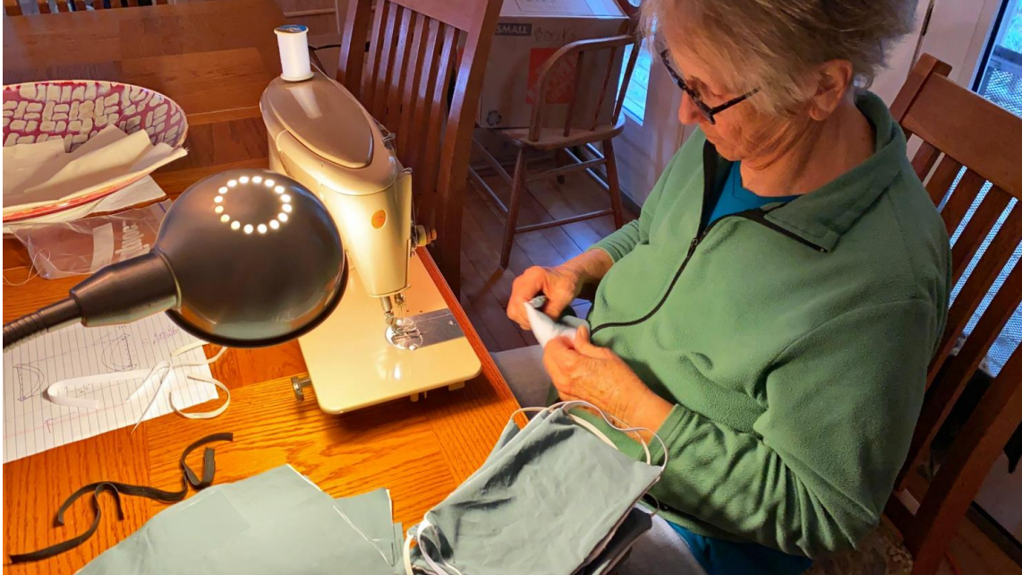
Theatre Department seamstresses have been making masks since mid-March.