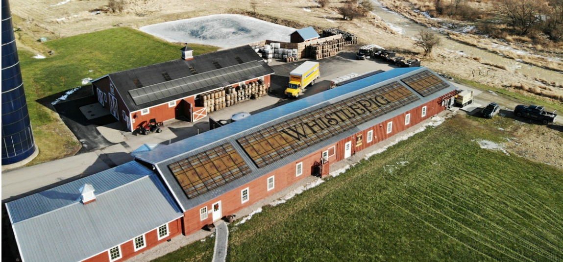
WhistlePig Whiskey Solar Array across the distiller's warehouse building and bottling plant