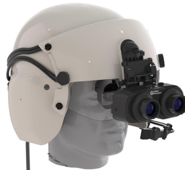
Collins Aerospace Systems new digital Enhanced Visual Acuity (EVA) system