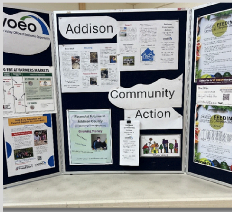
Addison Community Action at Orwell's Food & Farm Fest.

VITA free Tax Prep. Call for an appointment.