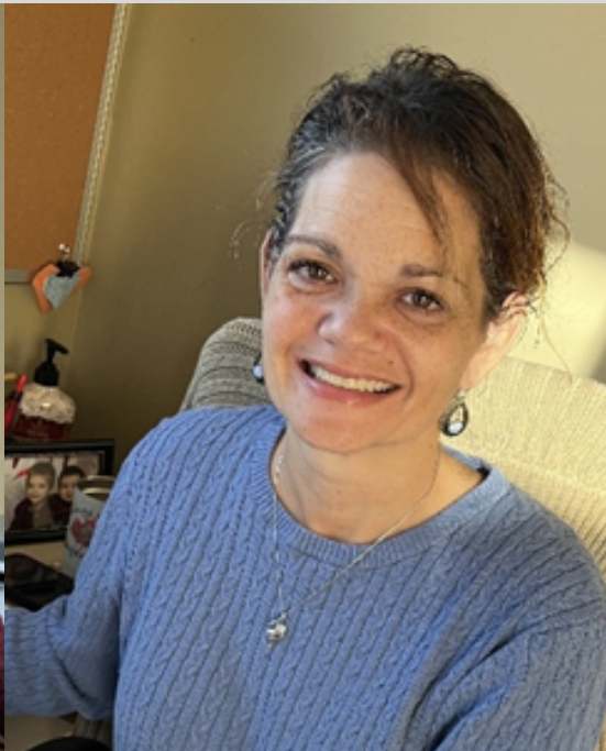
Zoraida Community News